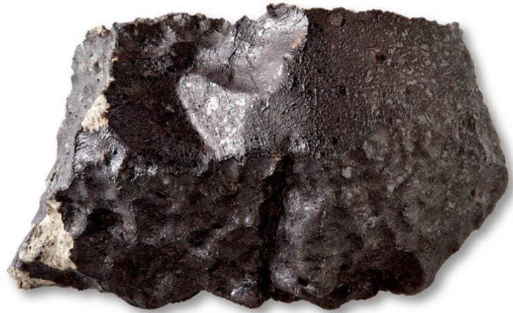
A piece of the Tissint meteorite, which fell to Earth in Morocco last year. In the Natural History Museum in London

Pieces of the meteorite are on display at several museums, including the Museum of Natural History of Vienna and the Natural History Museum in London.