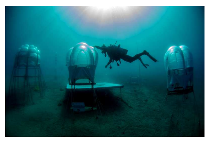
The air temperature inside the underwater greenhouses stays close to a balmy 84°F, with a humidity of 90.5 %.