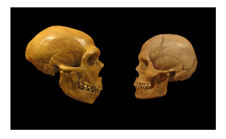
Comparison of Modern Human and Neanderthal skulls from the Cleveland Museum of Natural History

certain diseases. Carmel believes that as more Neanderthal DNA is analyzed, we will begin to understand the evolutionary changes that created the modern human. "There is a huge potential," he says. "Studying epigenetic characteristics could be of great importance for zooming in on the properties that have shaped what we are today."